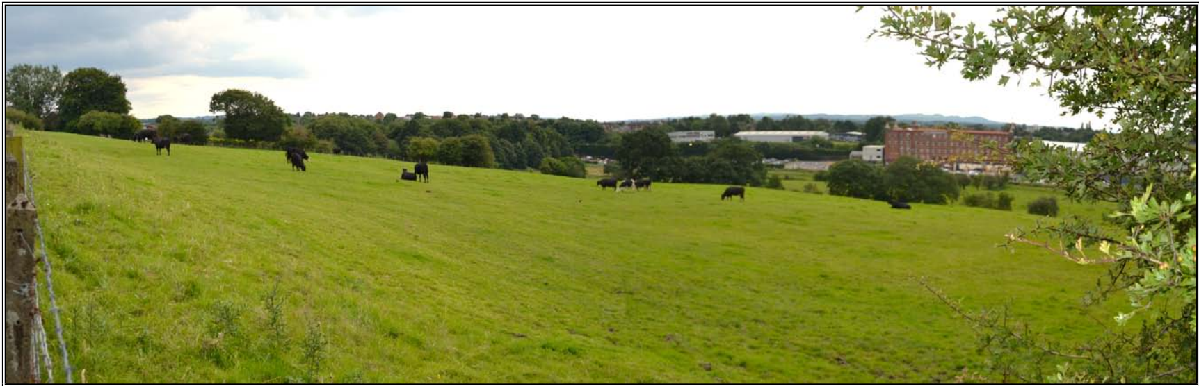
Residential Development Land at Knowle Farm, Blackburn Road, Chorley PR6 8TN