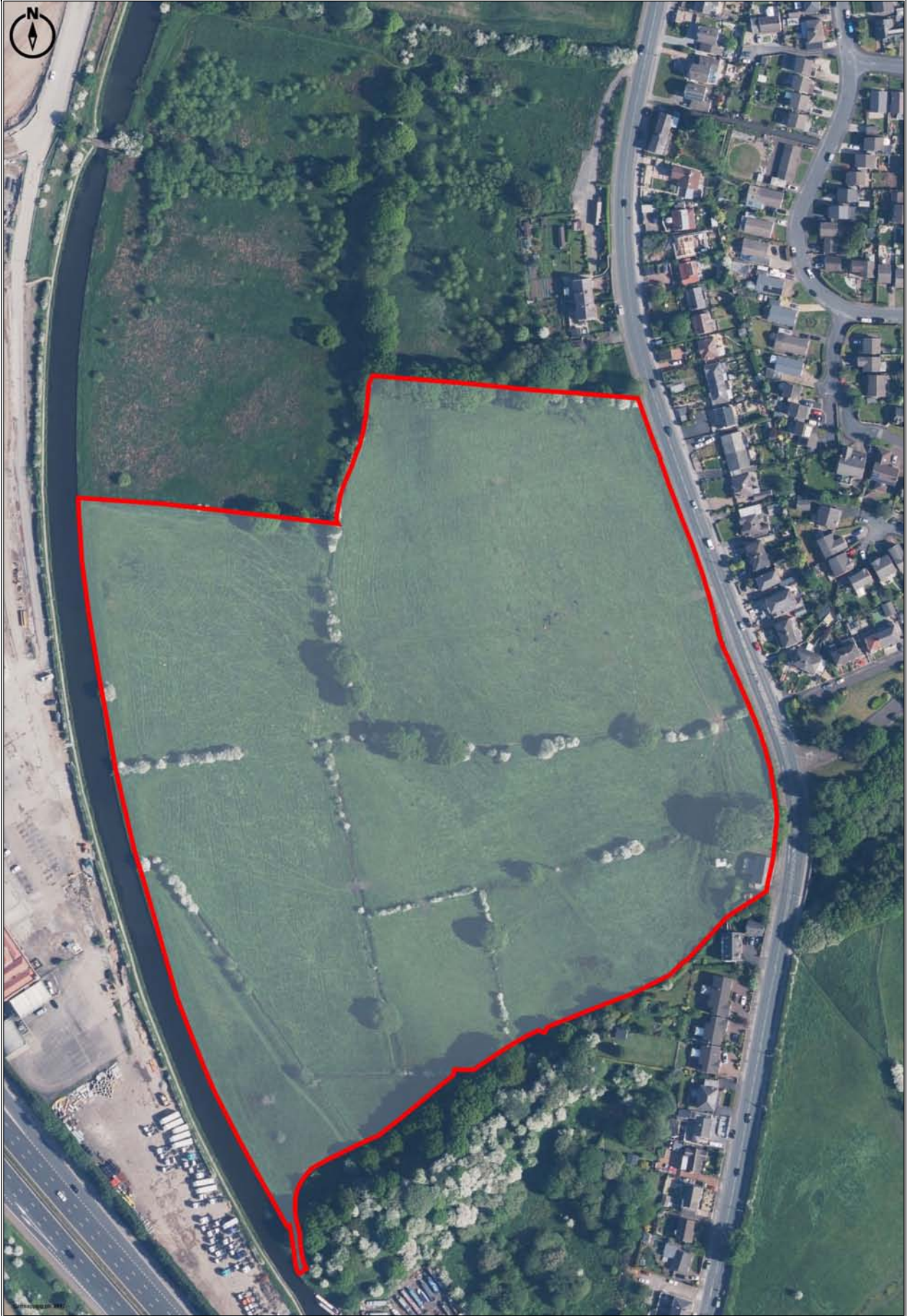
Residential Development Land at Knowle Farm, Blackburn Road, Chorley PR6 8TN